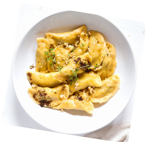
Our crew and wine club members enjoyed meals just like this one on the Danube River Cruise this year. Yum!

Boil the ravioli in generously salted water (that tastes like ocean water), about a dozen at a time, for 1-2 minutes. Meanwhile, melt the butter for the sauce in a skillet. Cook over medium heat, swirling the pan, until the butter turns brown. Remove from the heat and add in the chopped sage. The butter will bubble up and lightly brown the sage as well. Keep the sauce warm until ready to serve. Using a slotted spoon, transfer the ravioli from the pot to plates. Top with sauce and a sprinkle of extra parmesan. Enjoy!