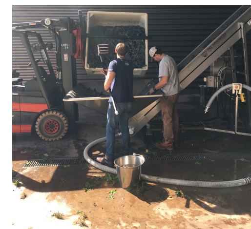
Harvest team de-stemming Mt. Veeder grapes prior to crushing

Mt. Veeder produces staggeringly intense and complex wines from its high altitude estate vineyards. This wild and isolated wine-growing region features panoramic views, sparse soils, steep terrain, and some of the lowest yields in all of the Napa Valley. Fierce winds and rocky, gravelly soil create grapes with intense flavor and ripe tannins. This vineyard is famous for its rugged terrain, where virtually all work in the vineyard must be done by hand. It was formerly a cattle ranch with its rolling hills and abundant sunshine. The same family has owned this land since 1885.